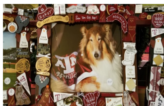
Tradition Line Frames

2 lines of personalization with additional cost.